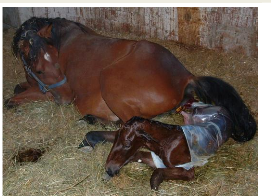
2005 Standardbred Mare pictures was take after 10 minutes from the activation of the alarm.